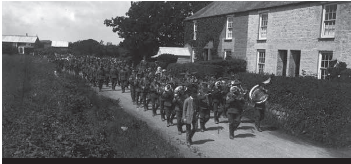
Recruiting drives drummed up patriotic fervour and encouraged local men to sign up. Few had ever before strayed more than a few miles from their homes and families