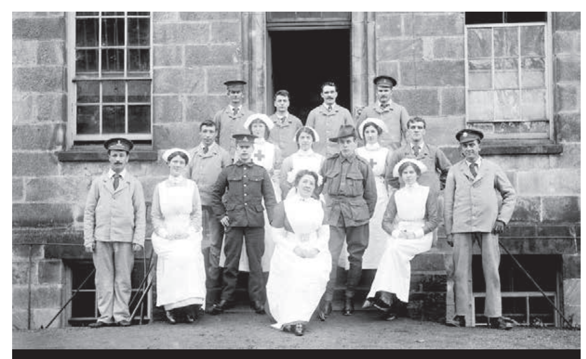
Officers and nurses at an auxiliary – or extra – hospital that opened in Truro in World War One. Thousands of women across the country volunteered for basic medical training to nurse the injured and mained

Women, for the first time in centuries, were sent to the front lines in the newly formed Women's' Auxiliary Army Corps. Nearly 10,000 of them worked as clerks and typists, cooks and cleaners, engineers, and drivers. Many already did these same jobs, but on the home front. Subsequently the War Office approved a similar arrangement for the Navy. The Wrens were founded in 1917.