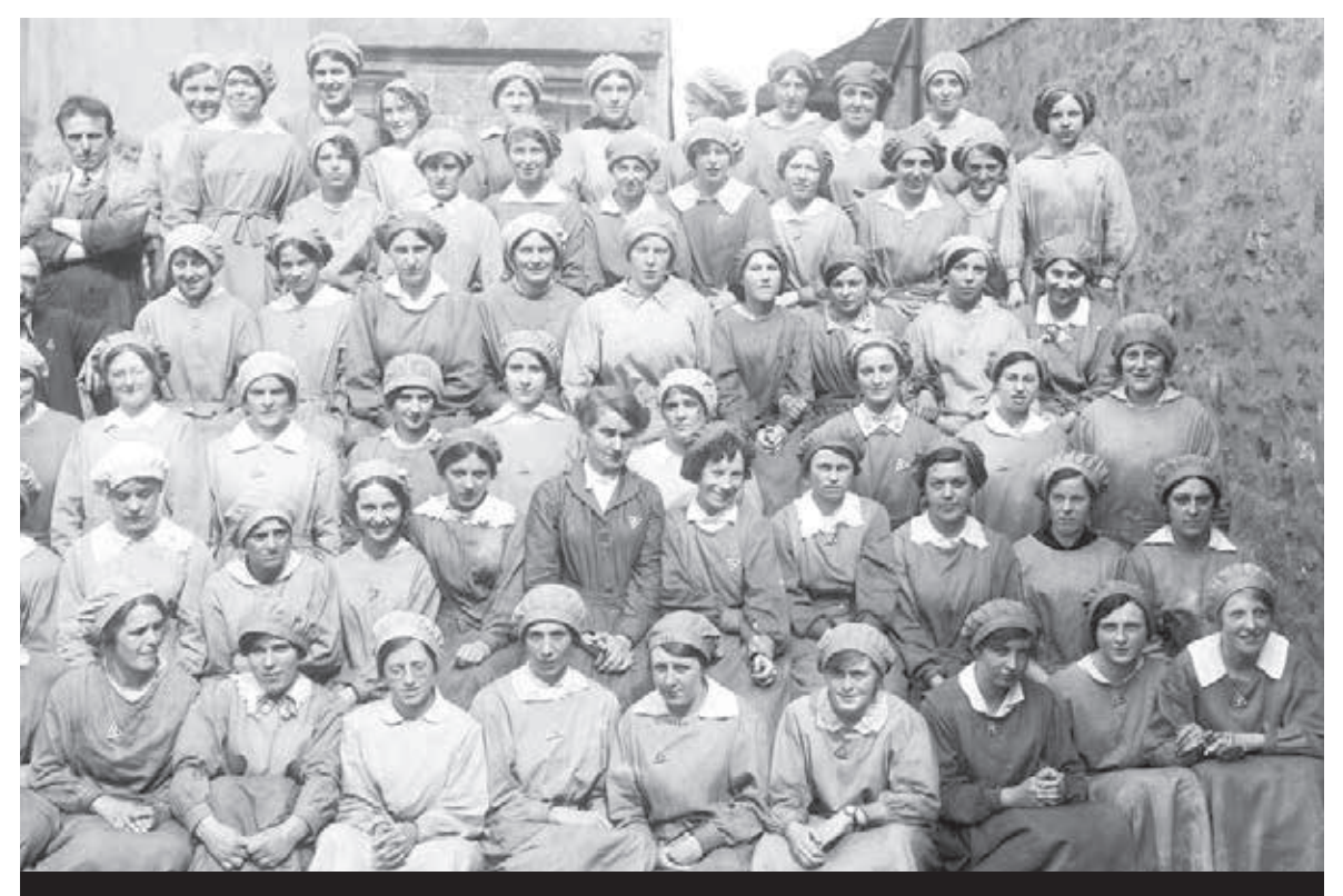
By 1916, three million women were working in formerly male occupations to support the war effort as the nation's men went off to fight.

It was not only explosions that killed or machinery that caused injuries. Even though deaths by poisoning (TNT and lead) were 'notifiable industrial diseases', they too were censored by DORA. Cancers caused by build-up of the toxic chemical cocktails were also recorded later in the war.